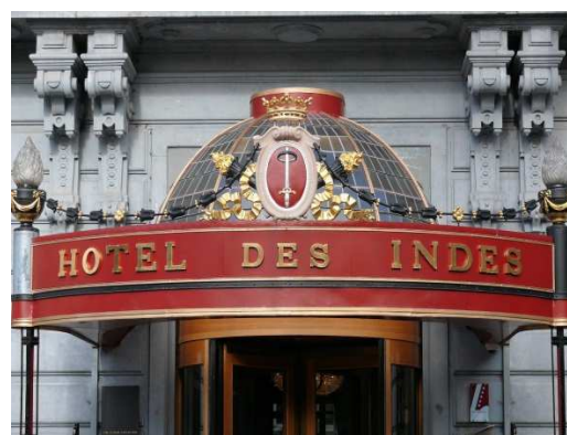
Hotel des Indes

Venue of the P.R.I.M.E. Finance Annual Conference 22 - 23 January 2018