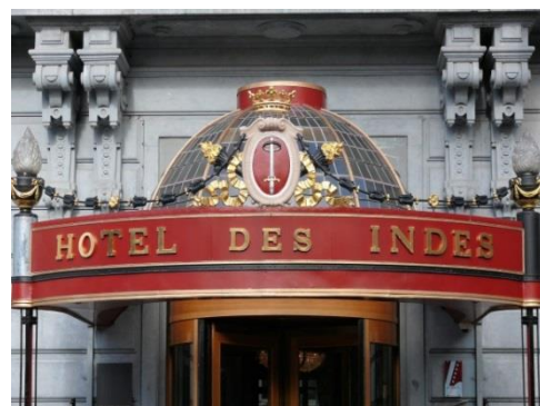
Hotel des Indes Reception & Conference Dinner 22 January 2018 at 19:00 hrs