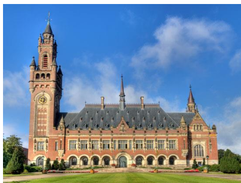
Peace Palace Venue of the P.R.I.M.E. Finance Annual Conference 22 - 23 January 2018