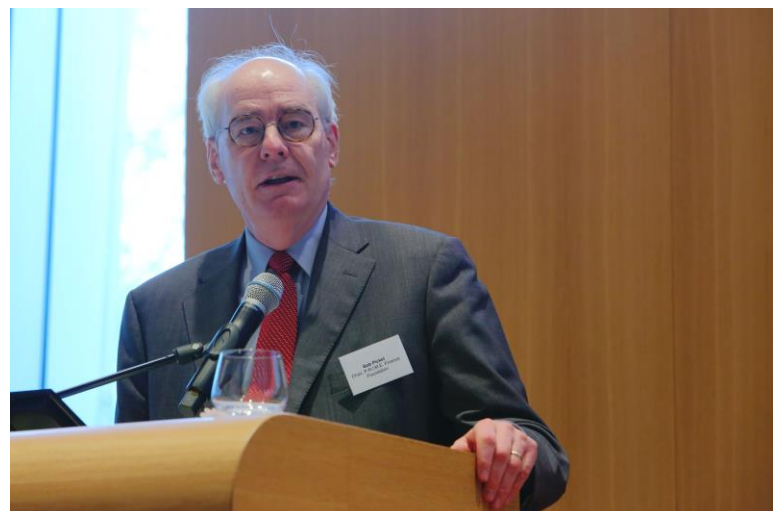
Chair of the Management Board The P.R.I.M.E. Finance Foundation