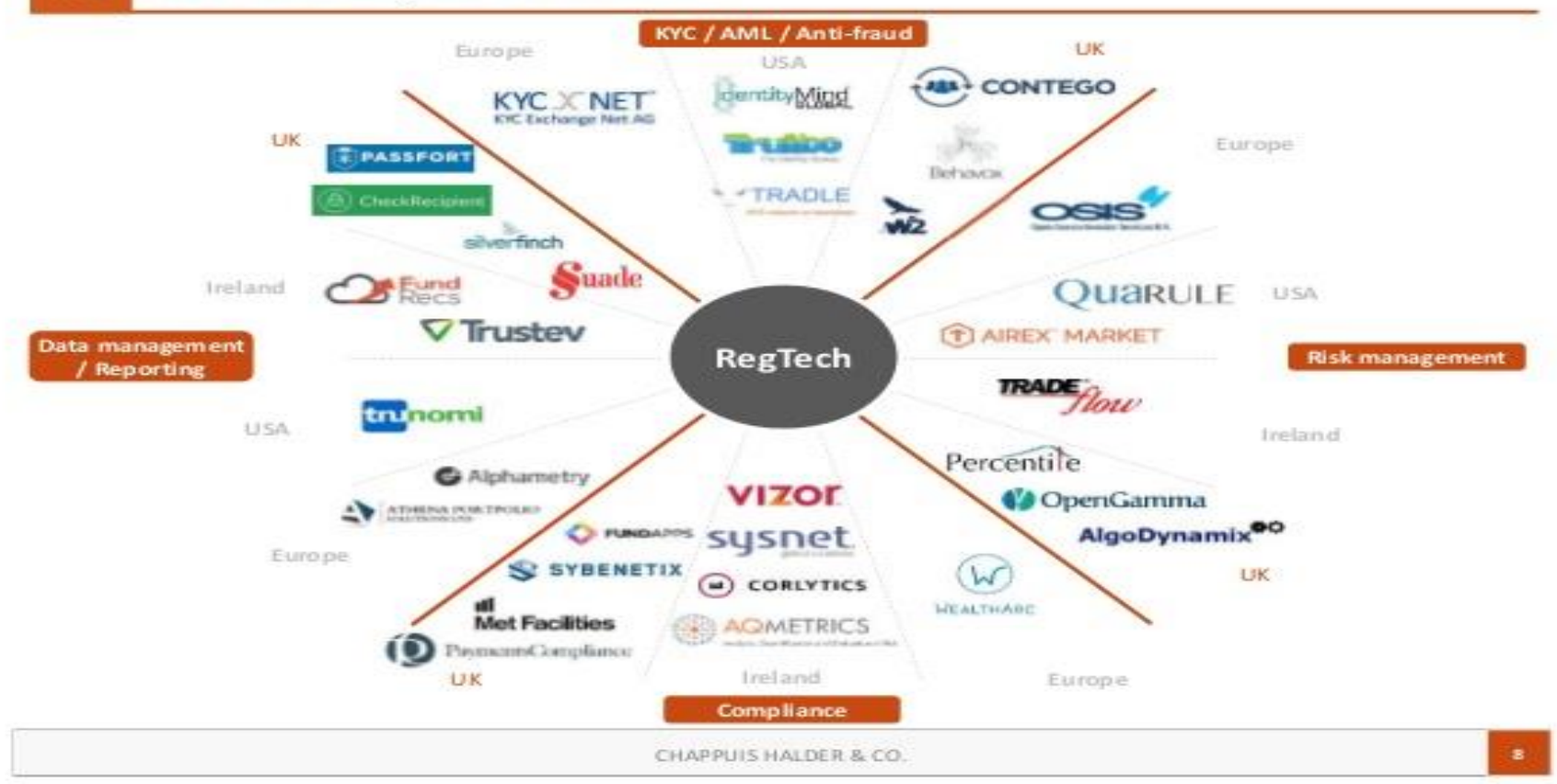
Illustration: landscape of existing RegTechs (non-exhaustive) See detailed list in appendix – slides 20 to 22