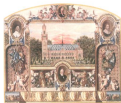
...Peace Palace... Venue of the P.R.I.M.E. Finance Annual Conference 23 - 24 January 2017