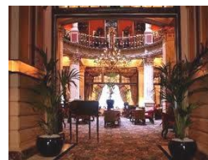
...Hotel Des Indes... Reception & Conference Dinner 23 January 2017 at 19:00 hrs