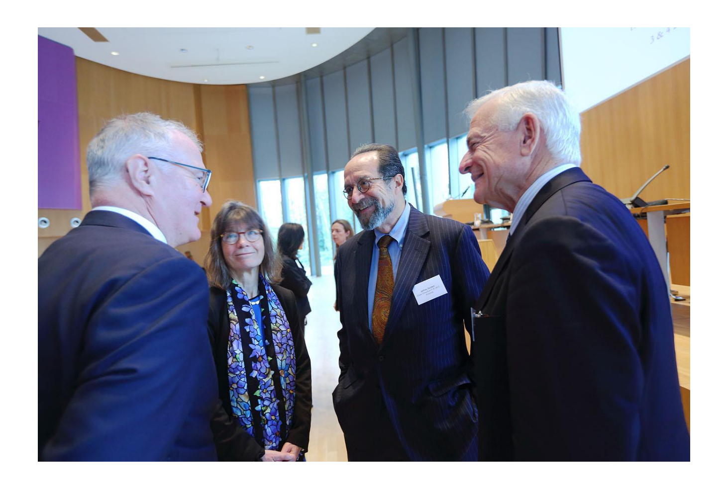
Agenda subject to change.