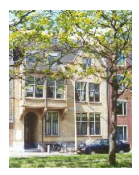
...Office of P.R.I.M.E. Finance...

Koninginnegracht 22 2514 AB The Hague The Netherlands T + 31 (0)70 8200 400 secretary@primefinancedisputes.org www.primefinancedisputes.org