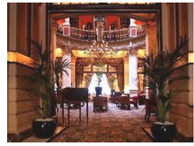
...Hotel des Indes...