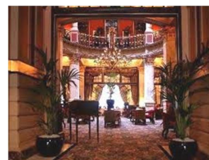
...Hotel Des Indes... Reception & Conference Dinner 23 January 2017 at 19:00 hrs